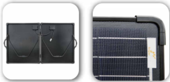
— product details —