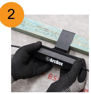
Snap the casing shut