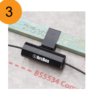
Mounting bracket available for in-roof applications