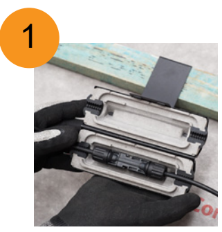
Place DC connector into enclosure with cables laid in grommet

Independently confirmed by the University of Loughborough Department of Engineering that temperature under load remains within connector manufacturer's guidelines.