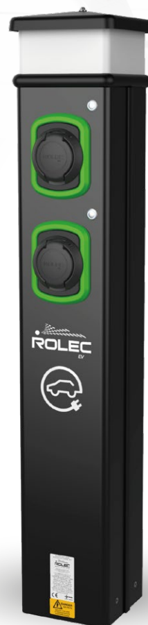
Unit shown: BASICCHARGE:EV SUPERFAST 2way Socket (Type 2) Charging Pedestal