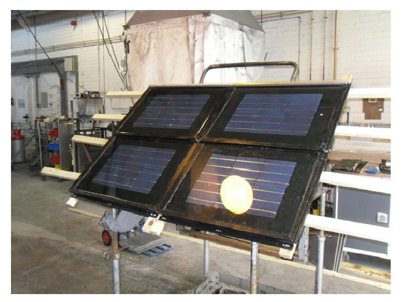
Plate 2 – 2 x 2 panel array prior to testing