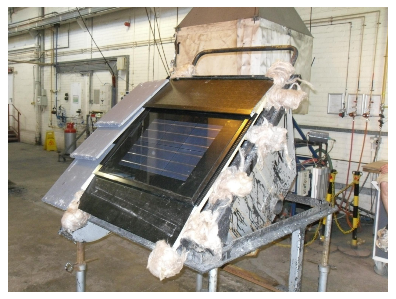
Plate 1 – Upper left corner prior to testing

Photographs of test samples as assembles / supplied immediately prior to testing:-