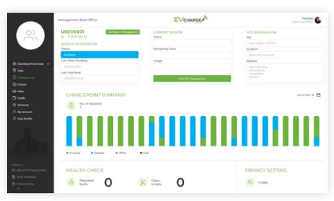
Chargepoint Summary Screen

Full visibility of real-time chargepoint activity, monitoring, CO_2 savings and energy usage all at the click of a button, helping you understand charging behaviours and where further infrastructure is required. You can easily access and export all historic data and reports.