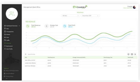
Revenue Summary Screen