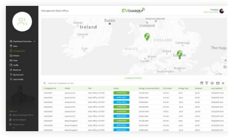
Chargepoint Network Screen