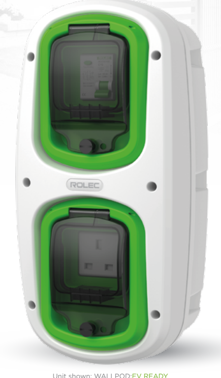
13amp Socket (Mode 2) Charging Unit